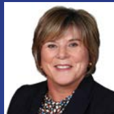
Mary Butler T.D.

"It's okay not to be okay, and it's also okay to ask for help."